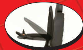
Flip-up arm rest